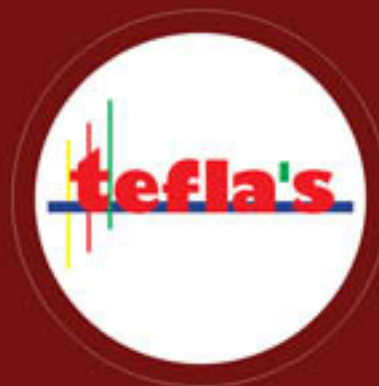
TEFLA'S Corporate Office